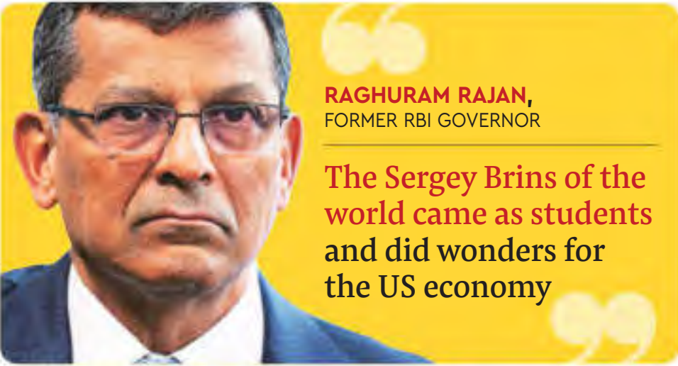
RAGHURAM RAJAN, FORMER RBI GOVERNOR

“The Sergey Brins of the world came as students and did wonders for the US economy,” Rajan said, pointing to one of the founders of Google. “To some extent, the problem is the universities haven’t made the case that they are so central to US growth, but also central to the distribution